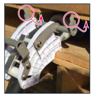
4. Position the tap top pins in the pallet openings