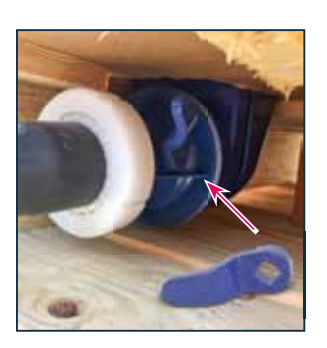
7. Put the blue key on top of the seal and turn the key down to open the seal