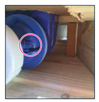
6. You will find the big box seal beneath the pallet