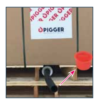
1. Pull the rubber hose out of the pallet and remove the red cap