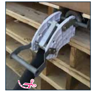
5. Shut off the tap and, if needed, cut it near the tap connection