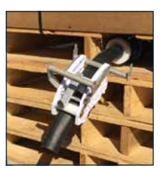
2. Pull the hose through the tap