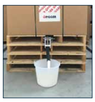
8. Open the tap to administer the milk